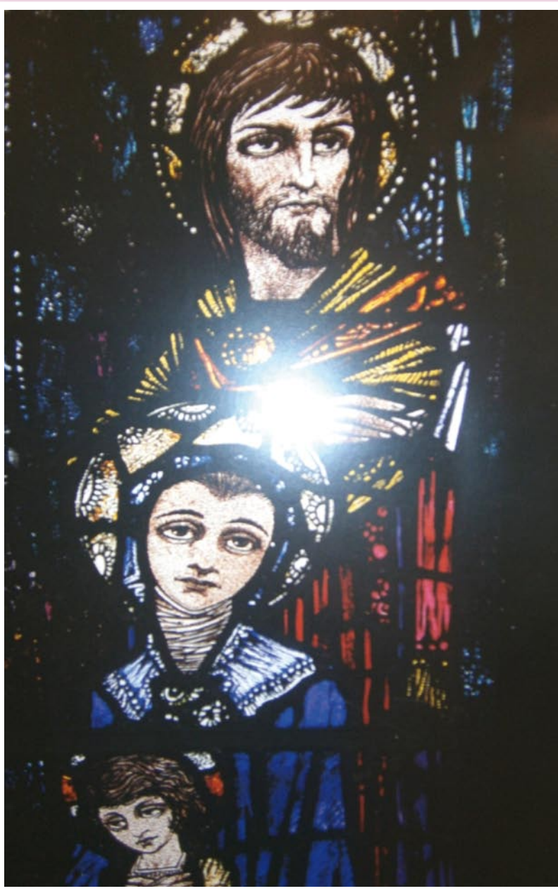
Stained Glass Window