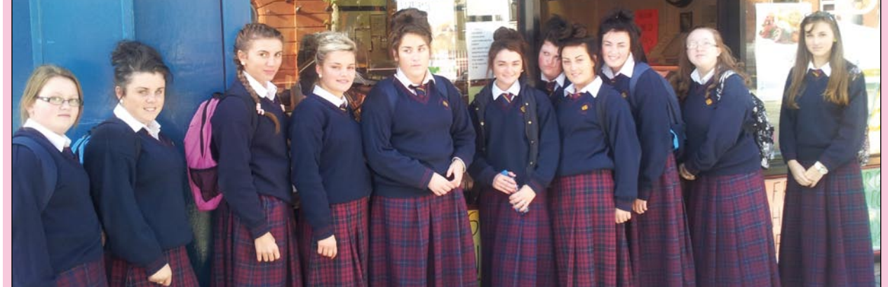
5th years on a trip to the local fish shop where they tasted freshly cooked lobster